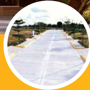
White Topping Road