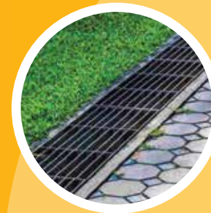
Storm Water Drainage